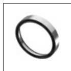
Accessories holder - Vector 55 AP91100