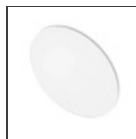
Lens for elliptical emission - Vector 55 AP91200