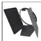
Adjustable dowsers - Vector 55 AP91500